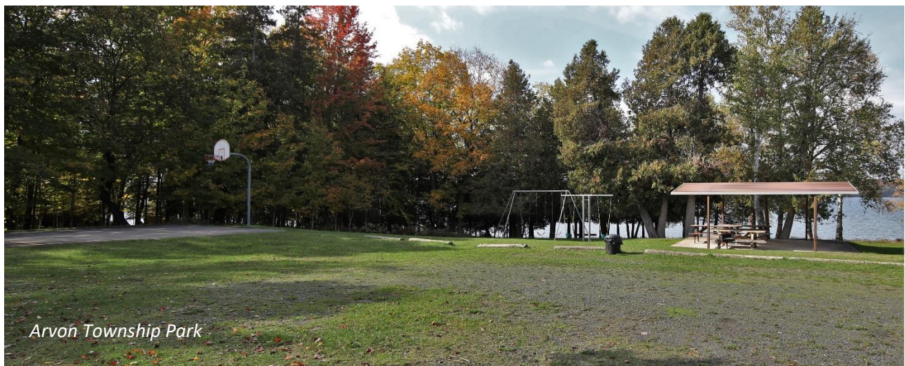
Arvon Township Park

Advance notice for the proposed adoption Public Hearing was also provided on the Arvon Township website and in an advertisement that was placed in the local newspaper on _____, 2023. The Planning Commission public hearing occurred on _____, 2023. A copy of the Public Hearing Notice, Adoption Resolution, and official meeting minutes will be provided, as required prior to DNR approval. In addition the Township Board also adopted a resolution of concurrence on _____, 2023.